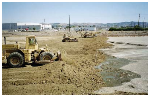
Right: Sludge stabilization, New Jersey